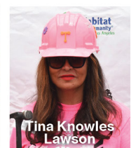
Tina Knowles Lawson

To learn more, contact our Resource Development team