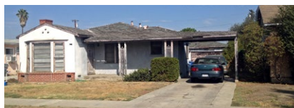
The Mewborn Home ( before home repairs )

Our goal is to fund 45 projects each fiscal year.