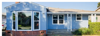
The Mewborn Home ( after home repairs )