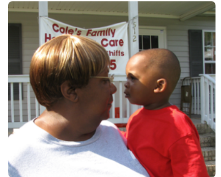
—Habitat of Forsyth County (North Carolina) and the Presbyterian Interracial Dialogue