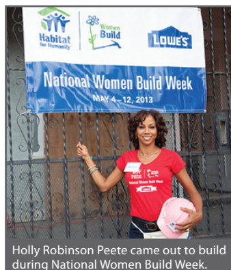
Holly Robinson Peete came out to build during National Women Build Week.

More than 10,000 women volunteered to build with Habitat for Humanity throughout the country as part of this year's National Women Build Week (NWBW). NWBW is an annual event sponsored by Lowe's that challenges women to spend a day helping build affordable housing in their local communities. In addition to sponsoring special events like NWBW, Lowe's underwrites the overall Women Build program and has contributed nearly $40